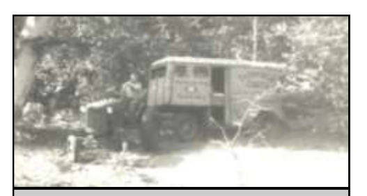
An old Co-op Dairy wagon from Sudbury was pulled by the first tractor to transport supplies