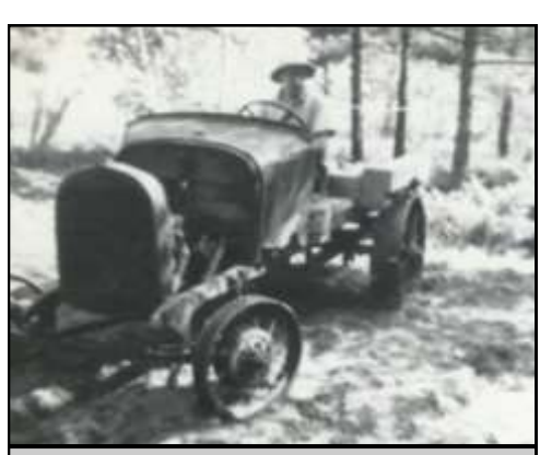
"Leapin' Lena" was used to transport building supplies during the construction of the camp