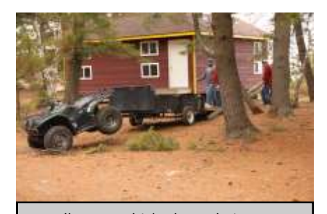
All camp vehicles have their own particular disadvantages