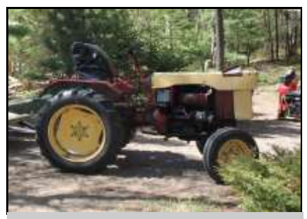
One of two Belarus tractors (the Love Bug) used when required on site today.

What about a special camp friendly type of monorail system from the camp dock to the dining hall? Preposterous? What do you think the mill workers would have said in 1885 if you suggested quads would be used by 2000?