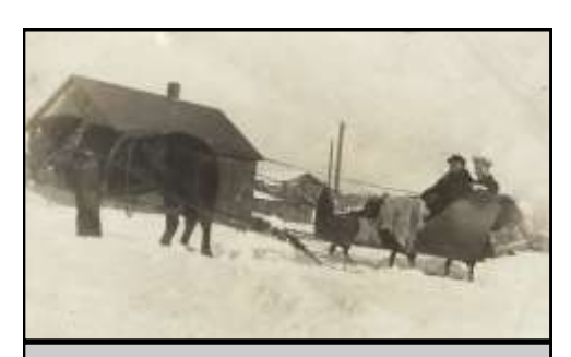
Residents of John Island during the days of the lumber mill in 1915