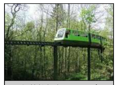
Could this be the next stage of transportation on John Island?