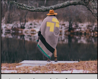
Look at the website for more Norquay Co. products