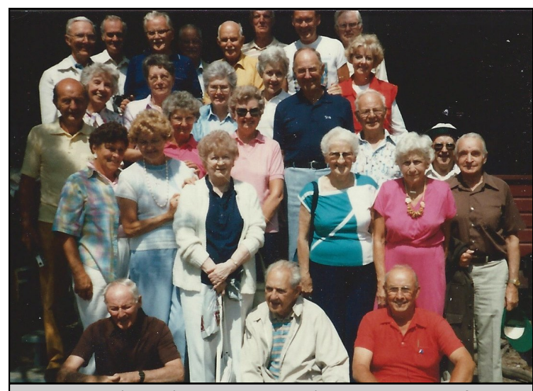
Sudbury Y's Men's Club in the 1980's as they gathered for a reunion at the camp with their wives

Back in the days when milk was delivered by horse-drawn wagons and radio had no competition from television, a group of men, supported by their wives, came up with the idea to build an overnight camp for children. In the late 1980's. This group of men and their wives visited the camp that they had built and that had been in use for over 30 years.