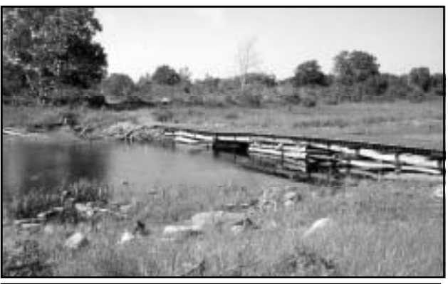
Left: Ironsides - 1972 - the original Ironsides was widened and lengthened by six feet in the years after this photo Right: the original bridge - over the Kwai in 1965 - notice the lack of trees and undergrowth on the shoreline, replaced and raised years later