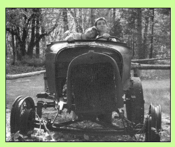
Staff are always looking for a good place for romance