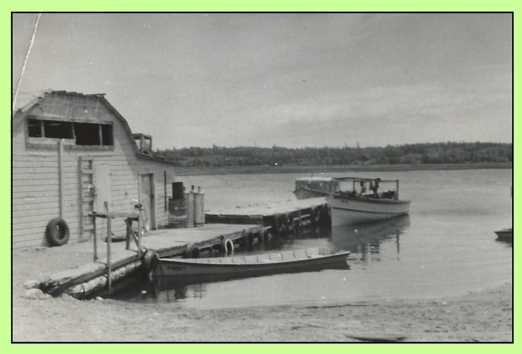
The ice house at Mitchell's dock in Spanish back in the '50's. Can you identify either of the 2 boats in the background?