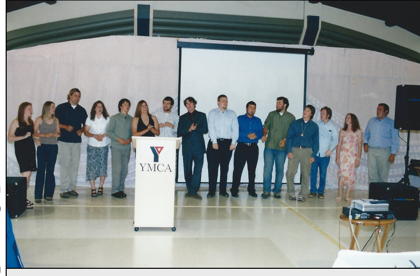
A few of the alumni at the 50th Anniversary dinner in 2004

There is that feeling that seeps through your soul as you sing "Johnny Appleseed" with a room full of John Islanders once again. It is the