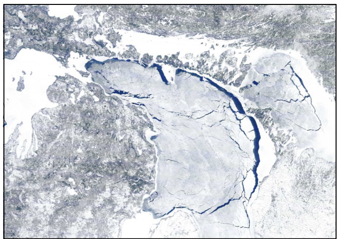
Lake Huron Ice Cover This Winter - Can you find John Island amongst the frozen landscape?

With the temperature still going down to –20c at night and the snow banks still growing as our long winter just keeps going on and on, it is difficult to comprehend that in eight weeks the first scheduled trip to John Island will