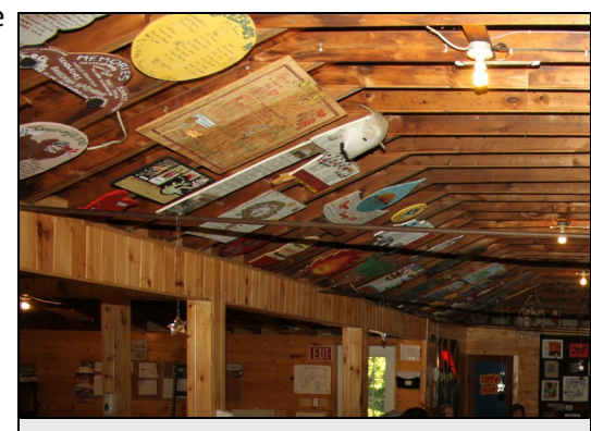
Plaques, some going back decades, adorn the dining hall ceiling

The amazing model of the Kismet crafted by Ian Gray resides in a special case on the dining hall wall. Danika Vandersteen's painting of the \,