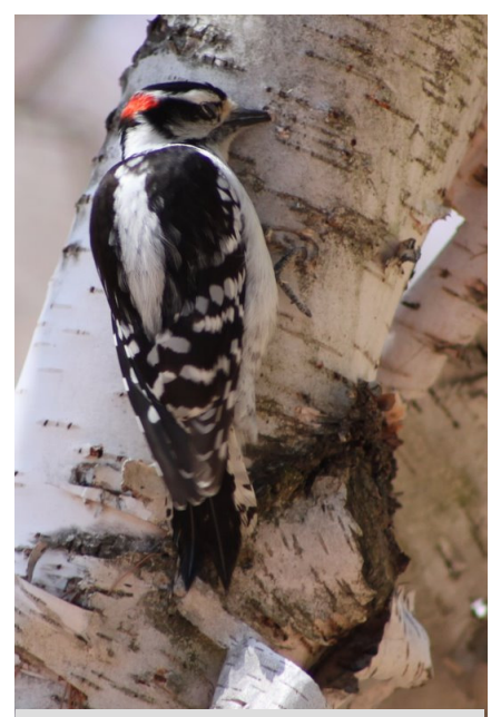
A John Island Downey Woodpecker

FROM LOONS TO SPOTTED SANDPIPERS, SANDHILL CRANES TO TREE SWALLOWS . . .