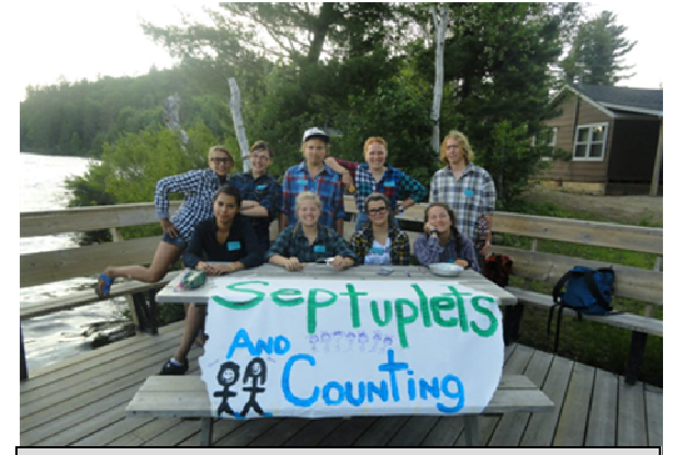
Program Norquays receive training at both Camp Falcona and John Island Camp.

The YMCA experience gave me the opportunity to meet some great friends and to learn about different parts of the world through international staff. I've heard some people call John Island "the Island beneath the sun", where friendships never end and you never stop learning. I developed amazing canoeing, sailing and problem solving skills as well as learnt how to deal with campers. This program has prepared me to become a leader and I hope that someday I'll be able to influence and share the camping experience with others.