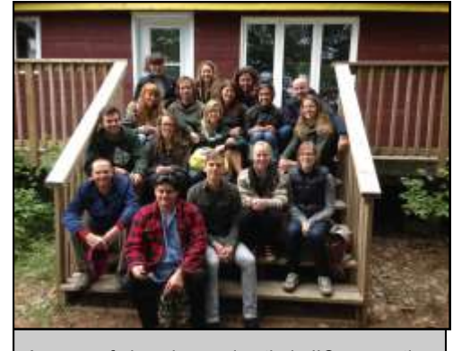
A group of alumni renewing their JIC connection

As alumni and their families munched on sandwiches and snacks in the dining hall, staff and campers from all six decades that the camp has operated